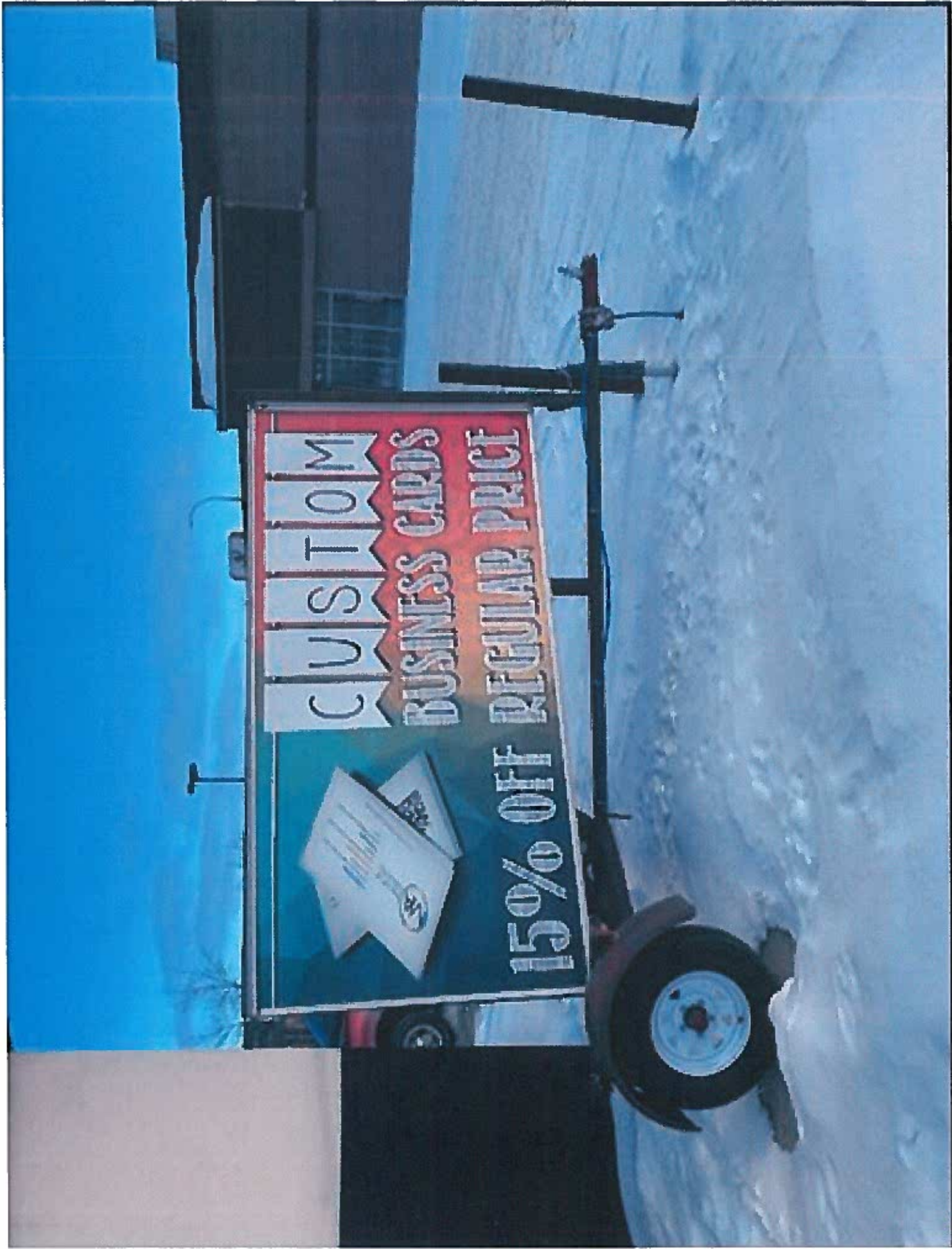
Sign measurements 10' long x 8' wide