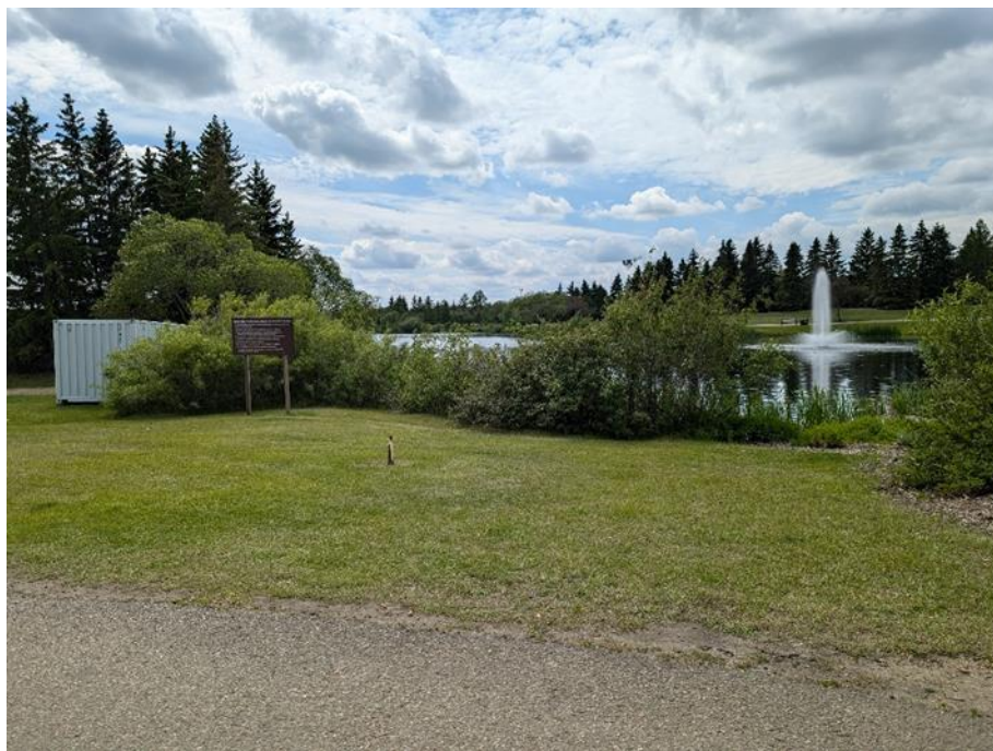
Figure 2: Option A, Beside Pond