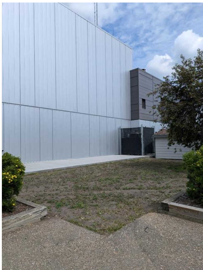
Figure 3: Option B, Beside BAC Building