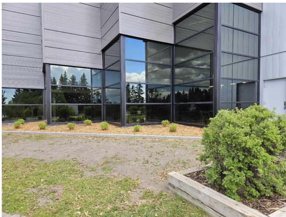
Figure 4: Option C, In Front of BAC Windows