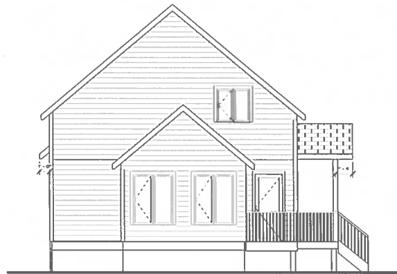
④ Left Elevation 1/4" = 1'-0"