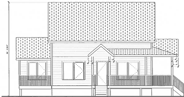
① Front Elevation 1/4" = 1'-0"