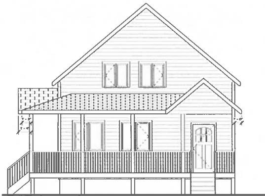
③ Right Elevation 1/4" = 1'-0"